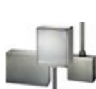
CS-480 & CS-600 Stainless steel suspension system