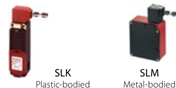
SLK Plastic-bodied SLM Metal-bodied