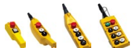
P02 PL03 PL05 PLB08