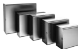
Stainless Steel Enclosures