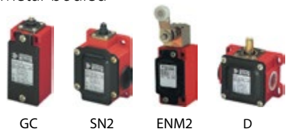
GC SN2 ENM2 D