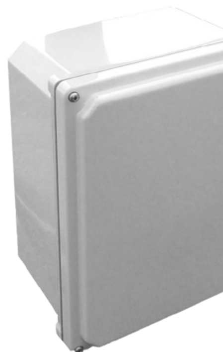
Integra Premium Polycarbonate enclosures