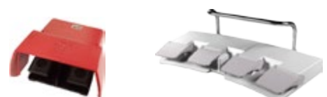
Industrial Footswitches Medical Footswitches