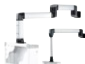
CS-3000 Medium load aluminium suspension system