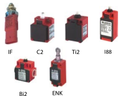
IF C2 Ti2 I88 Bi2 ENK