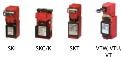
SKI SKC/K SKT VTW, VTU, VT