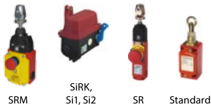
SRM SiRK, Si1, Si2 SR Standard