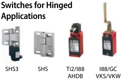
SHS3 SHS Ti2/I88 AHDB I88/GC VKS/VKW