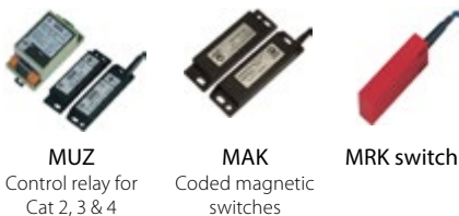
MUZ Control relay for Cat 2, 3 & 4 MAK Coded magnetic switches MRK switch